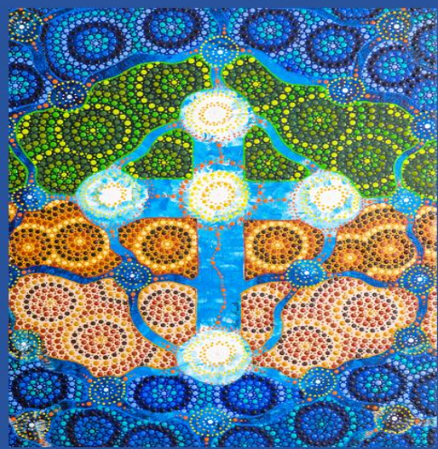
Aboriginal and Torres Strait Islander Sunday Sunday, 3 July 2022 www.natsicc.org.au

The harvest is plentiful, but the labourers are few Get up! Stand up! Show up!